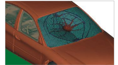
Extended finite element method (XFEM) for simulation of glass damage

plex environments such as automotive and aerospace crash and impact simulations.